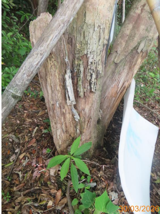
13: U041_Wood damage at trunk union#1