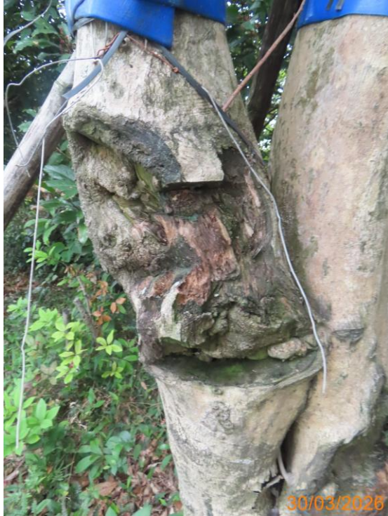
21: U043_Wound on trunk#2