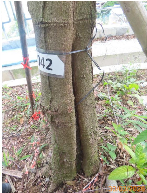
16: U042_Wound on trunk base