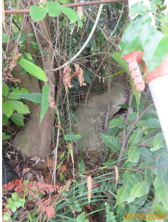
6: T8231_Trunk base