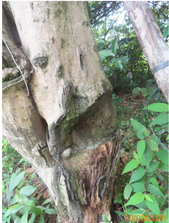
20: U043_Wound on trunk#1