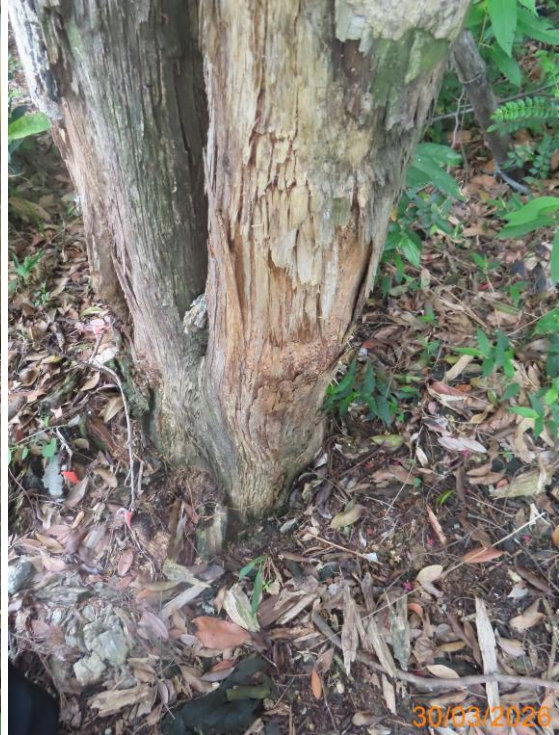
14: U041_Wood damage at trunk union#2