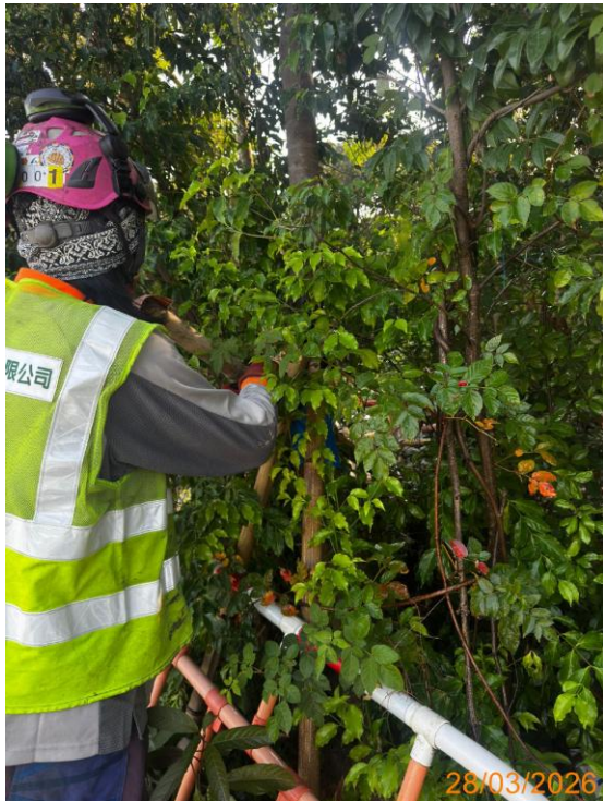
23: Adjust protection pad for T8231