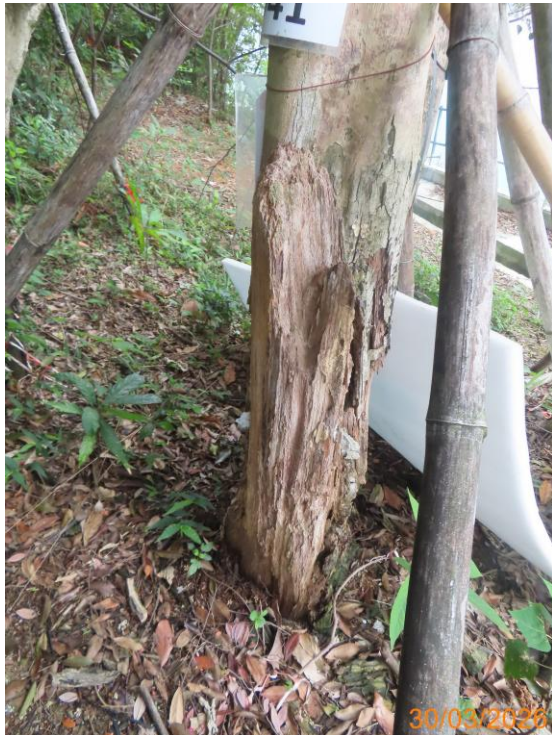
11: U041_Trunk base