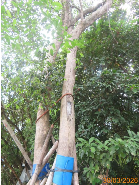
9: U041_Abnormal bark crack