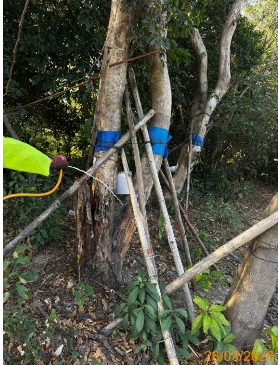
22: Application of pesticide for U041