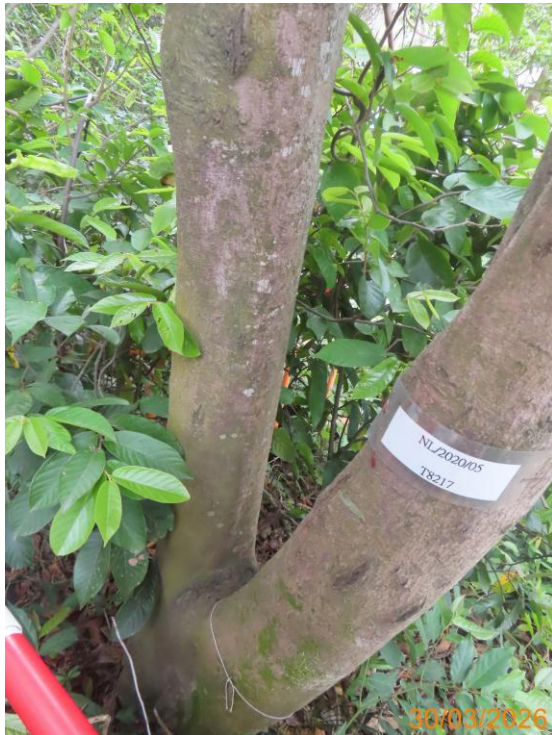
3: T8217_Trunk base