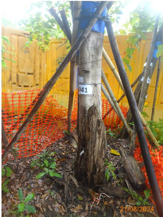
7: U041_Dead stump