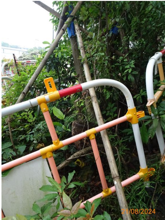
15: Slit rock and protection zone