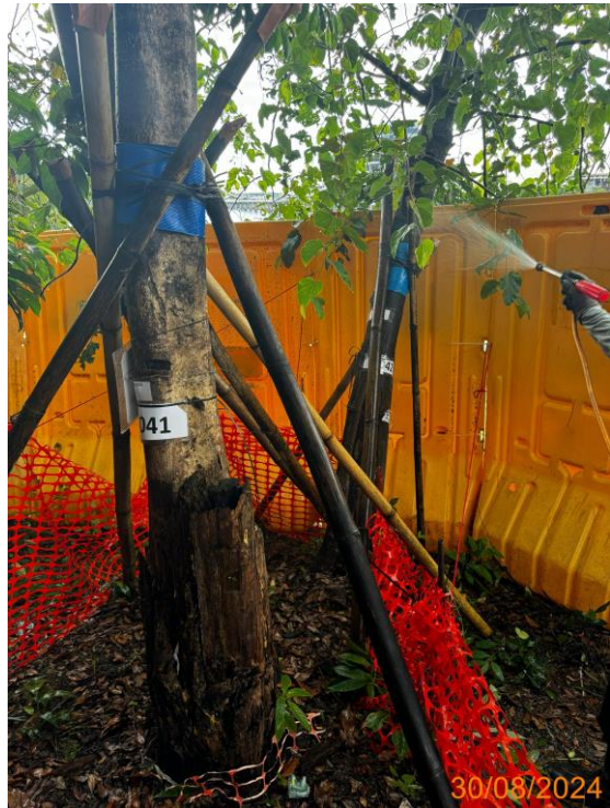
18: Application of fungicide to U041