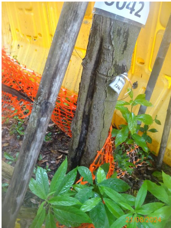
11: U042_Wound on trunk