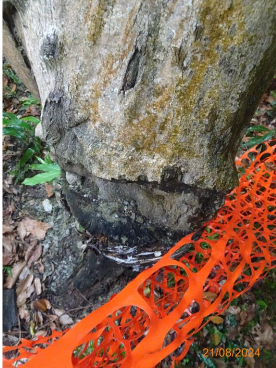
13: U043_Wound on trunk