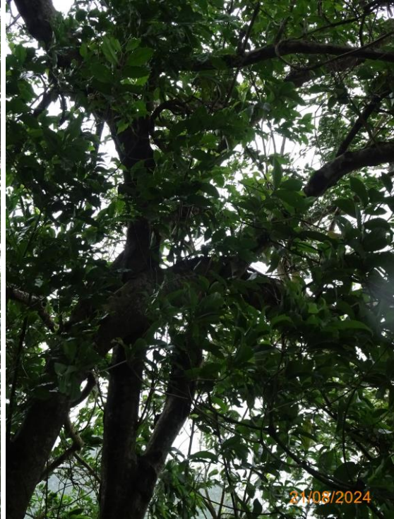
2: T8217_Cross branches