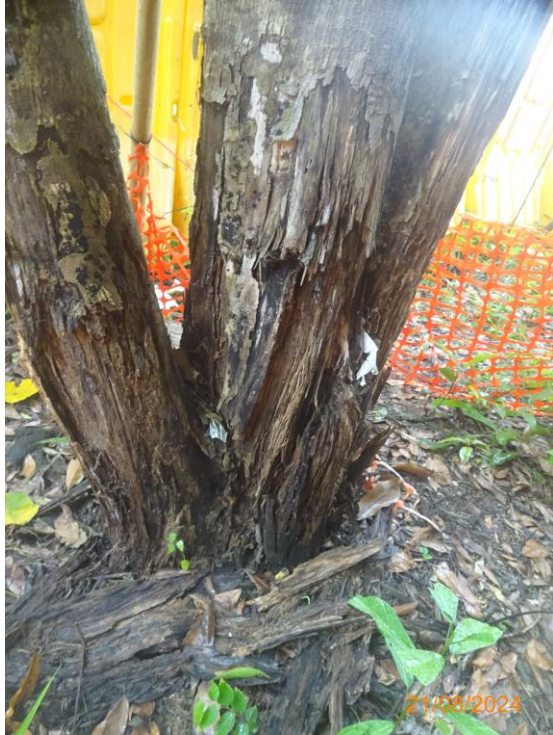
9: U041_Peeling off of bark_Close up