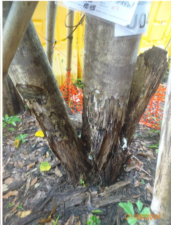
8: U041_Peeling off of bark