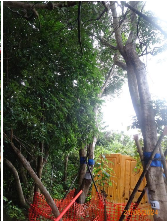
16: Temporary protective fencing for U041, U042 and U043