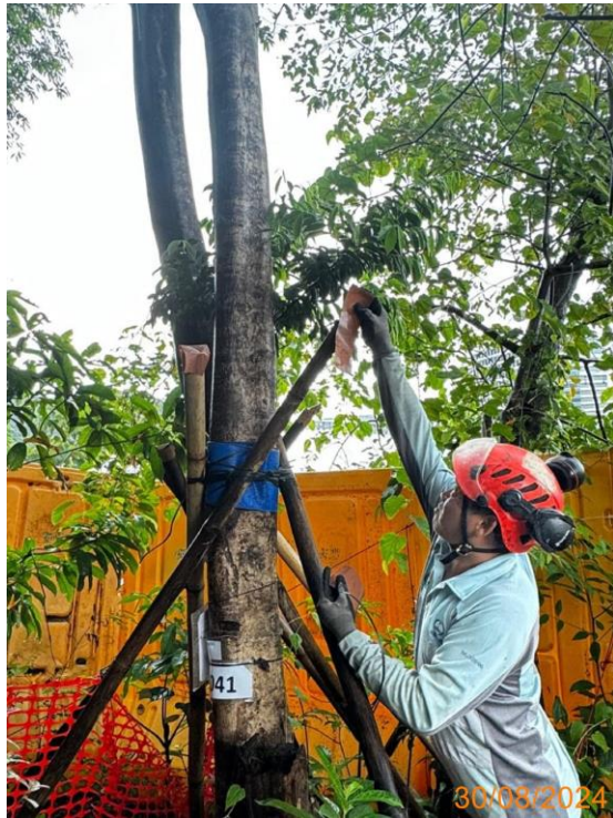
17: Adjust staking of U041