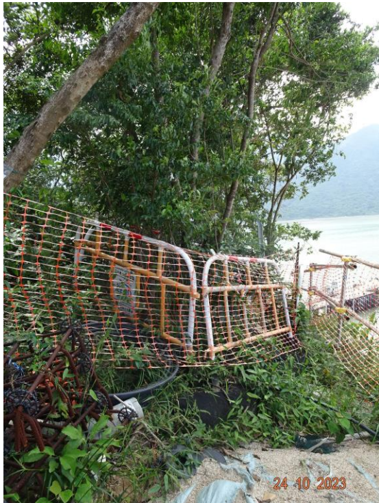
19: Silt rock and protection zone