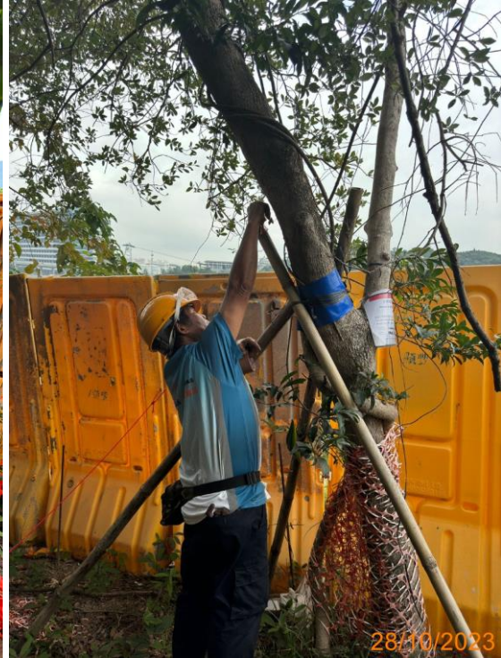
18: Readjustment of staking