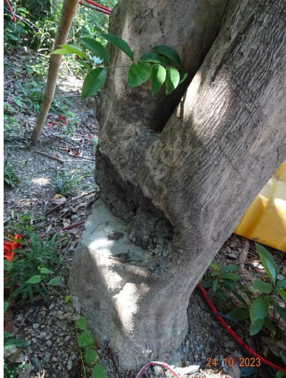
14: U043_Wound on trunk#1