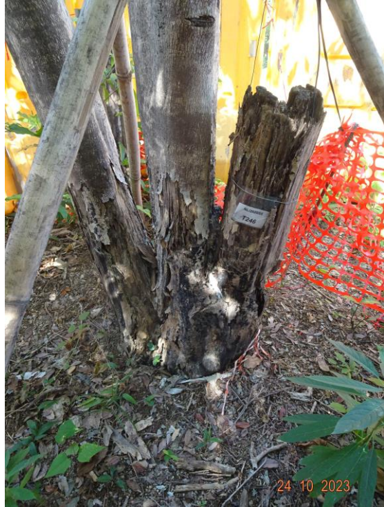
6: U041_Dead stump