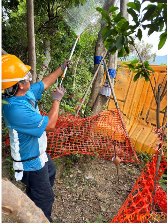
17: Spraying of pesticide