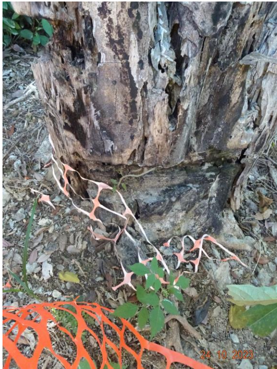
7: U041_Wood damage at trunk union