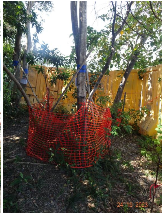
20: Temporary protective fencing for U041, U042 and U043