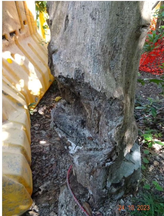
16: U043_Wound on trunk#2