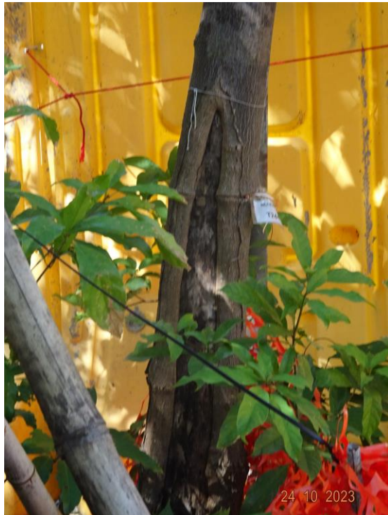
11: U042_Wound on trunk