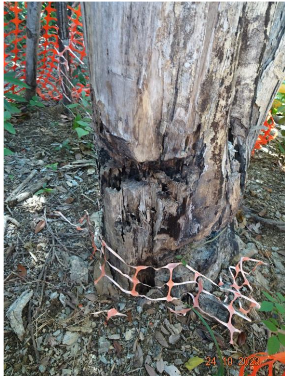
8: U041_Wood damaged by termite