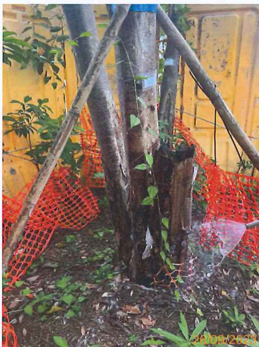
15: Spraying of pesticide