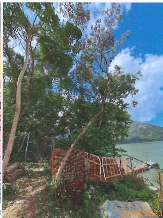
16: Silt rock and protection zone