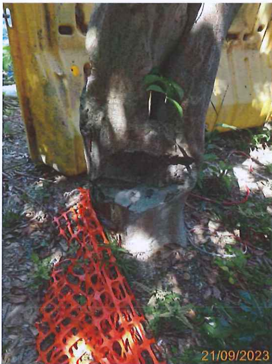
13: U043_Wound on trunk#1