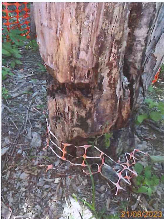
8: U041_Wood damaged by termite