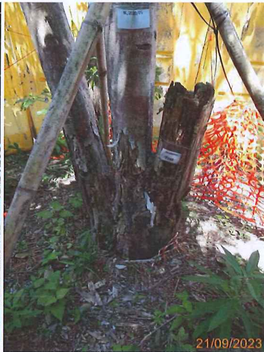
6: U041_Dead stump