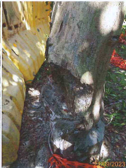
14: U043_Wound on trunk#2