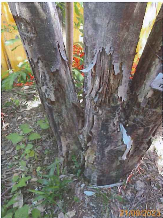
7: U041_Wood damage at trunk union