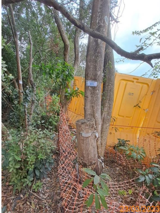
9: Temporary protective fencing for U041, U042 and U043 (2)