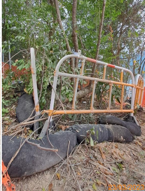
10: Protective fence sealed by silt rock composed of wood chip