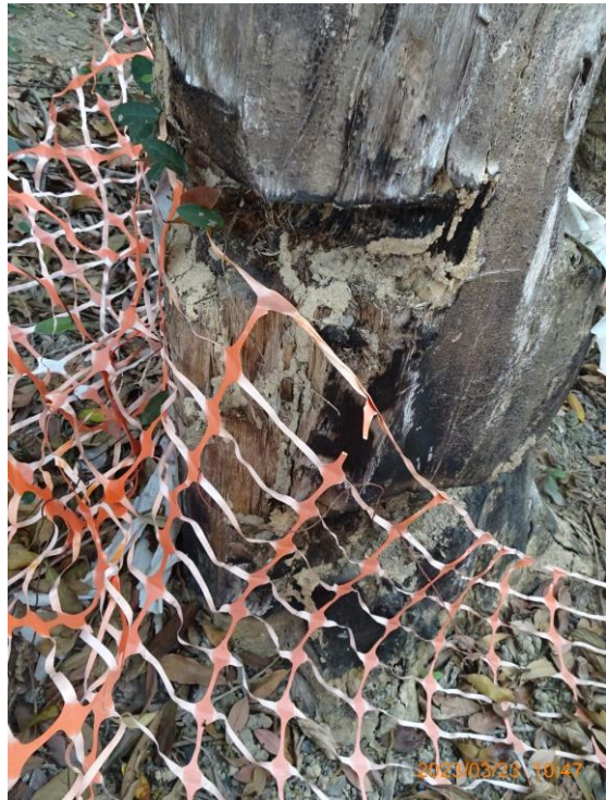
4: U041_Old termite track