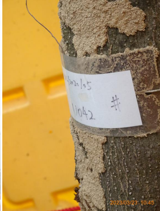
6: U042_Old termite track