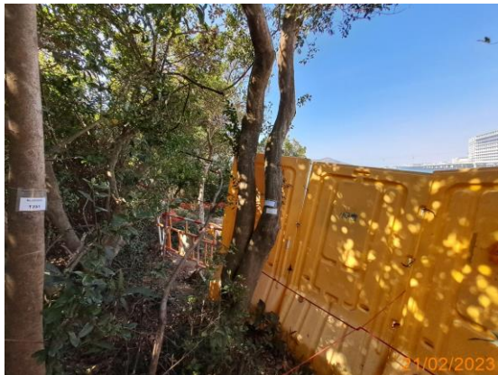
7: Temporary protective fencing for U041, U042 and U043 (2)