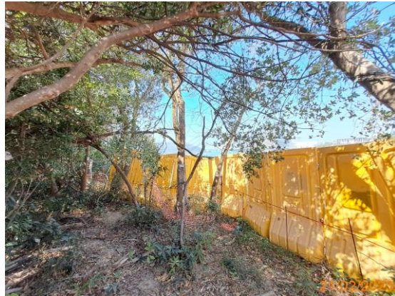
6: Temporary protective fencing for U041, U042 and U043 (1)