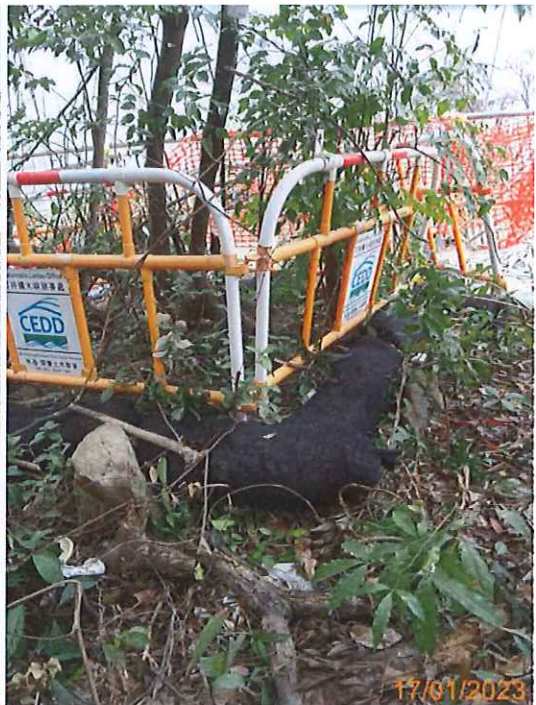
8: Protective fence sealed by sand bag